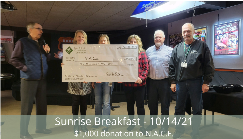
Sunrise Breakfast - 10/14/21 $1,000 donation to N.A.C.E.