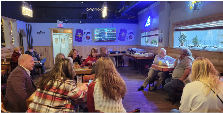
Holiday Meeting - Smokey's Pub & Grill